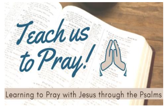
Learning to Pray with Jesus through the Psalms