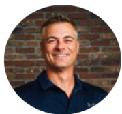
Dane Ortlund @daneortlund